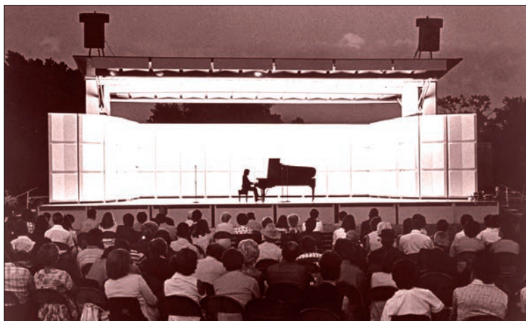
In 1976 the first summer concert is held on six acres acquired in 1974 by the Festival Institute as a storm brews on the prairie.

Herbal Forum and Plant Sale, Fri.-Sat., Mar. 20-21, Festival Hill Campus 50th Anniversary Gala, Sat., Apr. 18, Festival Hill Campus