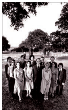
First eleven piano students at Festival Hill in 1976.